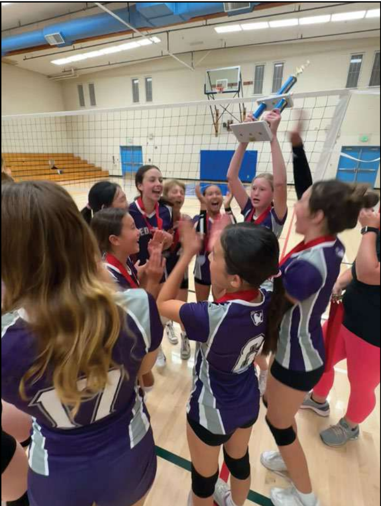
Piedmont players hoist the second-place trophy at the East Bay Middle School League Tournament.

Between October 15-18, PMS competed in the 10-team EBMS League Tournament in Martinez