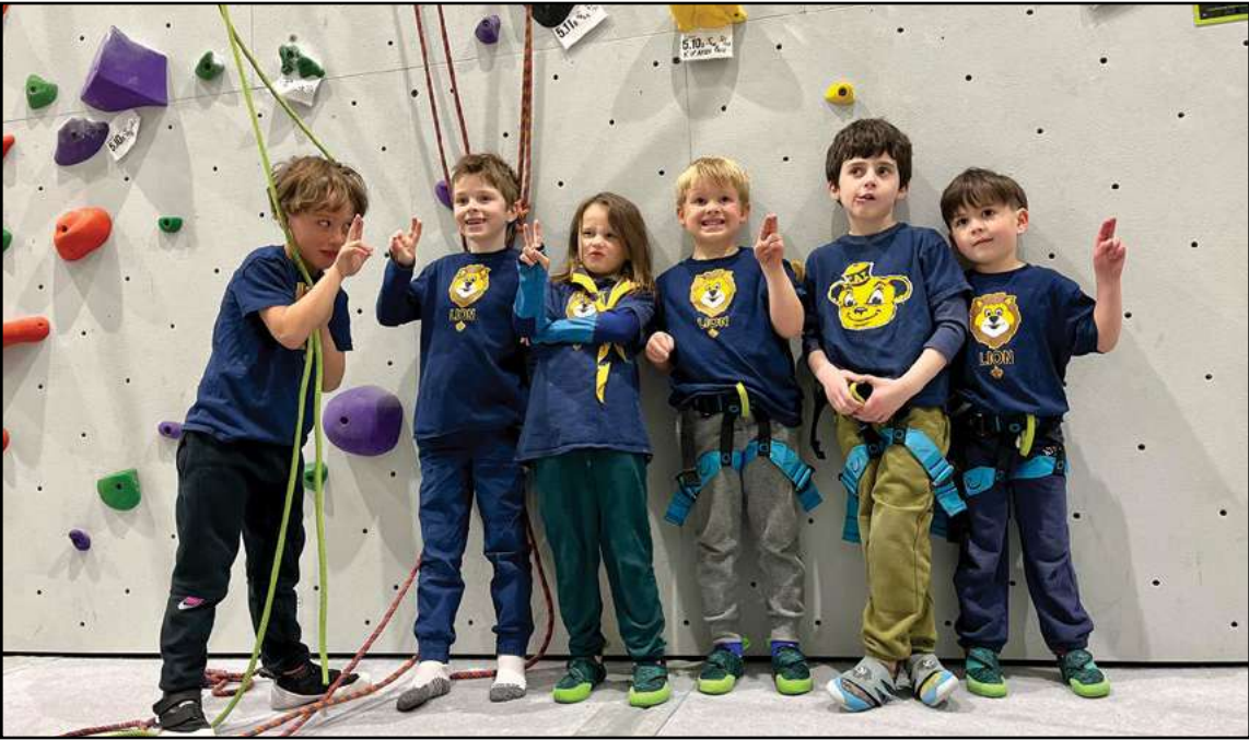
Pack 5 Cub Scouts tackle a climbing wall.