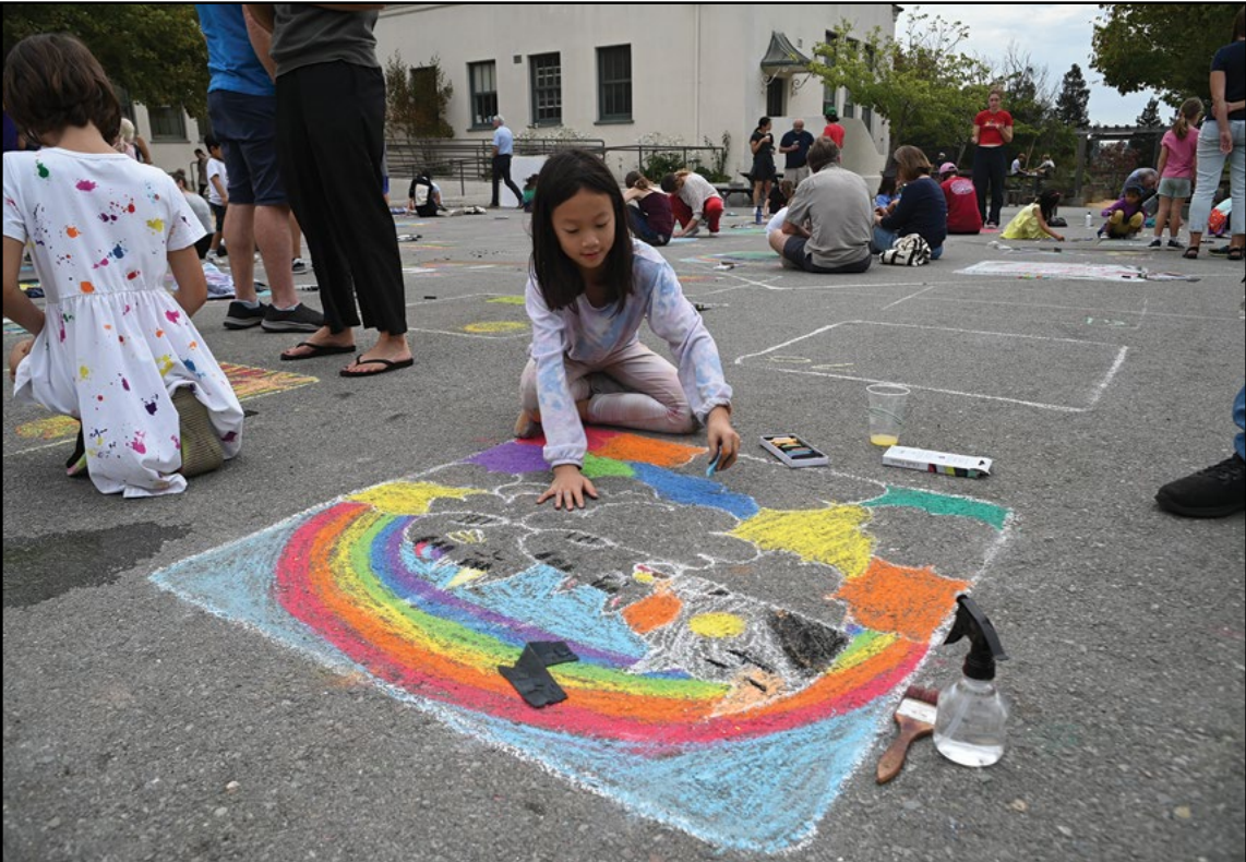
The Chalk Art Festival runs concurrently with the Beach Dads Club Pancake Breakfast.

premium Pancake Toppings Bar, juices, fruits and snacks. The fun will include the music of a DJ spinning kids’ favorite songs.