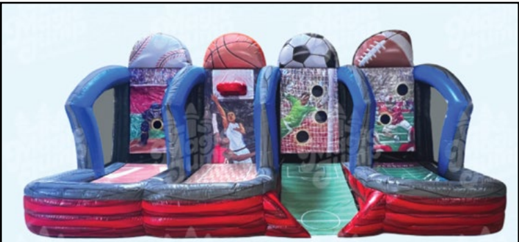
The fun and games zone will also have a 4-in-1 Sports Shootout.