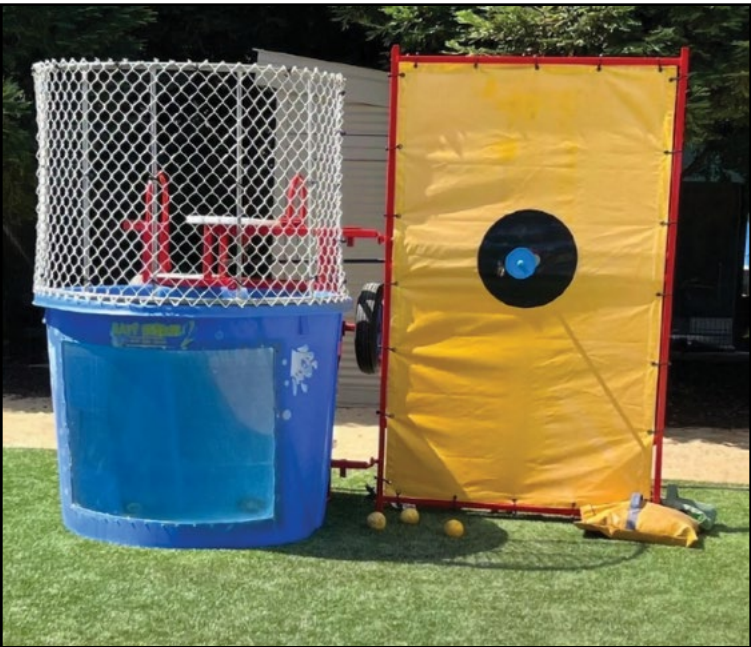
A Dunk Tank will be set up on the Beach playground during the 20th Beach Dads Pancake Breakfast on Sunday, September 7.

This year, the Pancake Breakfast will also feature a representative from Good Eggs onsite with a goodie bag & giveaway table, a